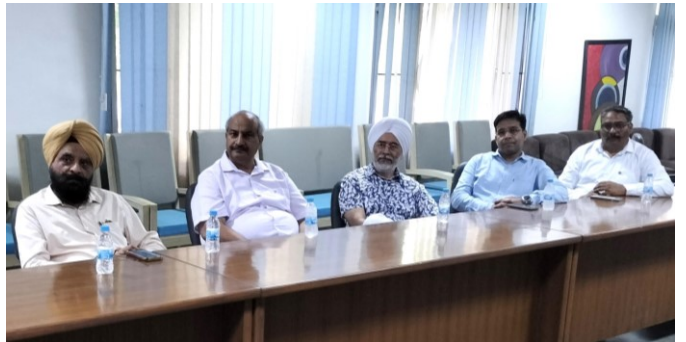
A vibrant gathering of IOCL Officers, Rotarians and R'Anns at RSIC