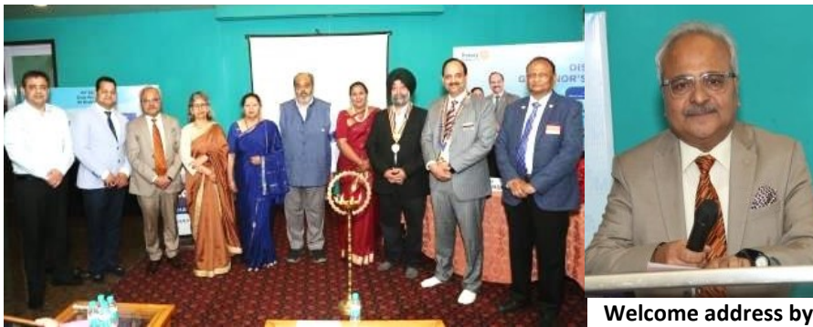
Lighting of Lamp, we Unite for Good