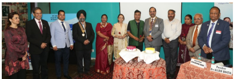
To enjoy more glimpses of DG's Official Visit, please click here to view our Facebook page