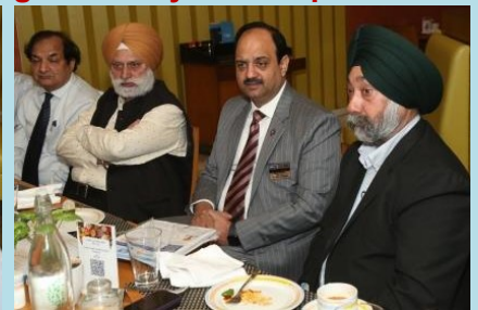
District Governor's meeting with Board of Directors