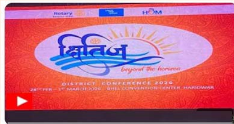
II District Conference 2026 II - 28-02-2026