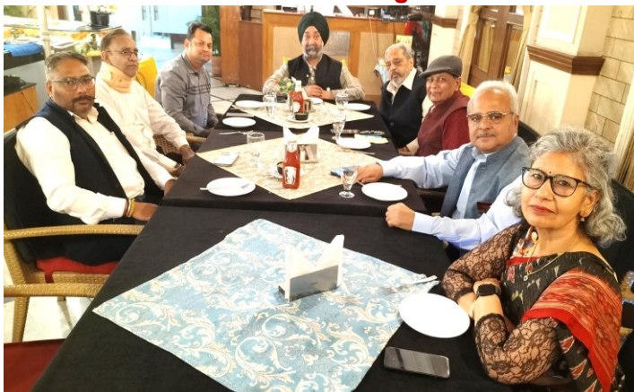
Board meeting of Rotary Chandigarh Tricity held on 26 February 2026 at Hotel Aroma, Chandigarh