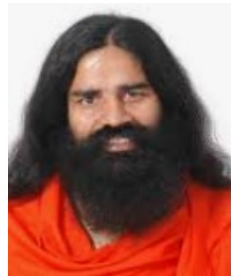
Baba Ram Dev