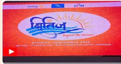
II District Conference 2026 II - 01-03-2026

Click above to enjoy both days of District Conference at Haridwar on 28 February to 01 March 2026