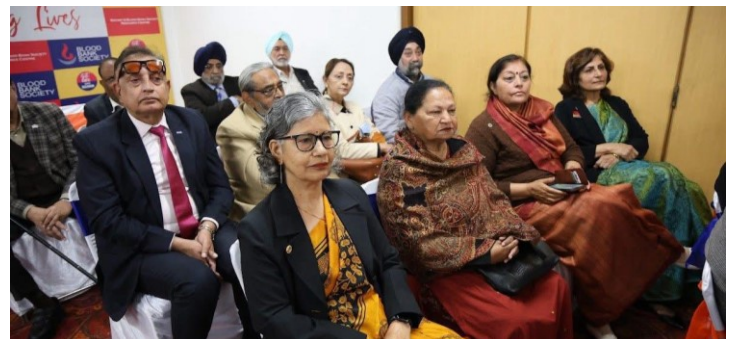
Rotarians from Rotary District 3080