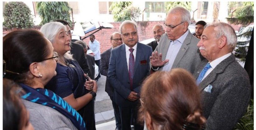
Rotarians having delightful discussion with chief guest