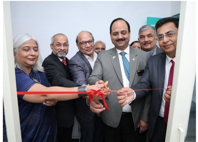
Inauguration of the facility