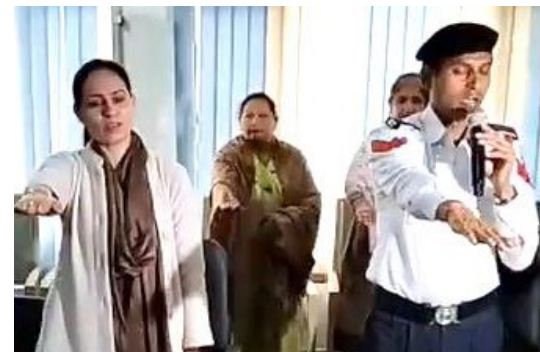
Oath to follow traffic rules